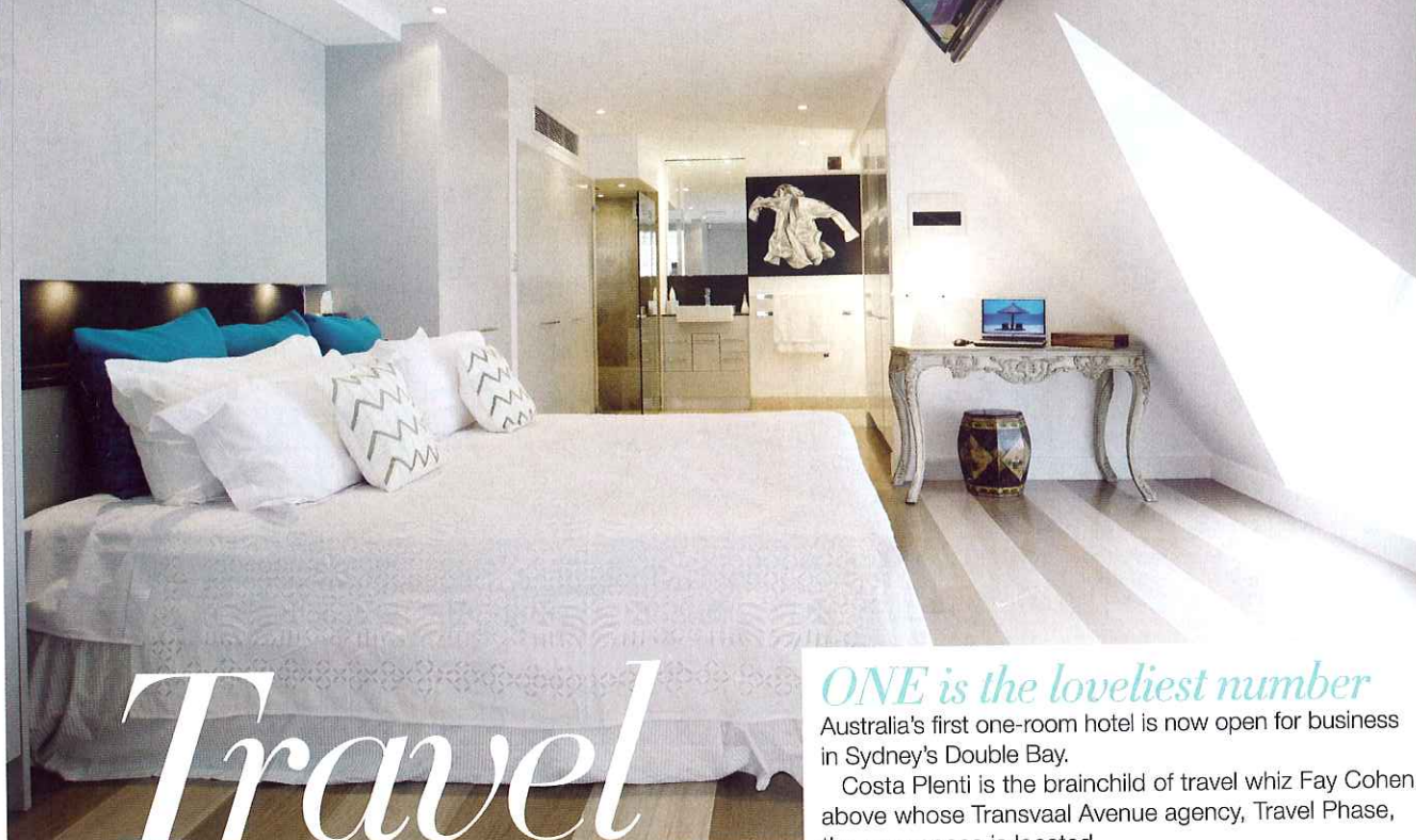
Alone time: Costa Plenti, Australia's first one-room hotel.